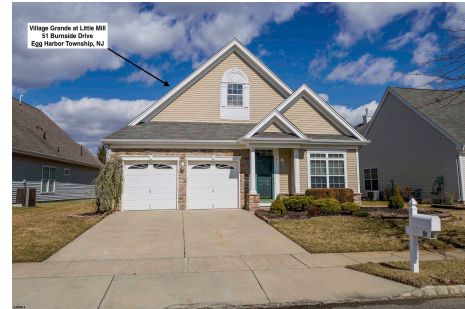
Village Grande at Little Mill 51 Burnside Drive Egg Harbor Township, NJ