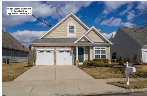
Village Grande at Little Mill 51 Burnside Drive Egg Harbor Township, NJ