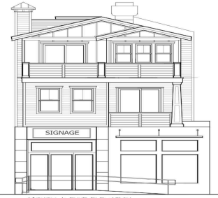
ASBURY AVENUE ELEVATION