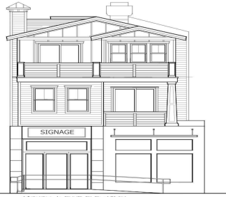
ASBURY AVENUE ELEVATION