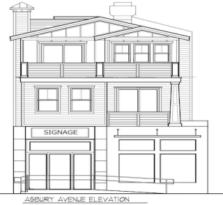
ASBURY AVENUE ELEVATION