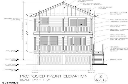
PROPOSED FRONT ELEVATION SCALE: 1/4" = 1'-0"