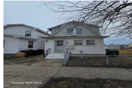
Galaxy S24 Ultra