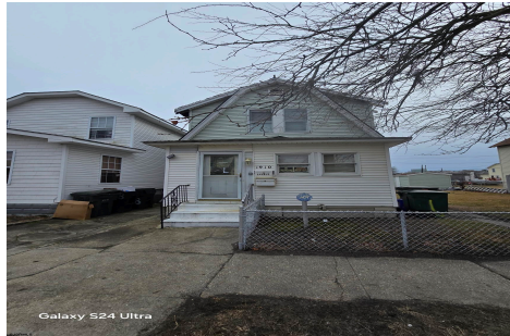
Galaxy S24 Ultra