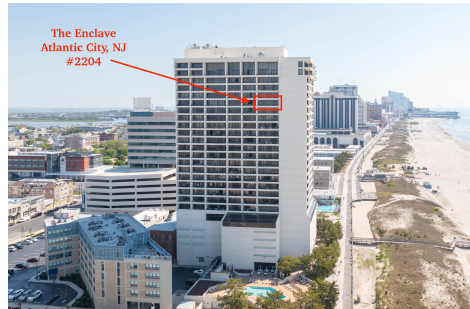
The Enclave Atlantic City, NJ #2204