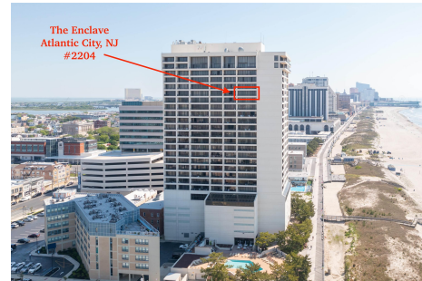
The Enclave Atlantic City, NJ #2204