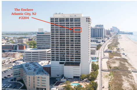
The Enclave Atlantic City, NJ #2204