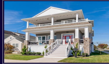
2400 WEST AVENUE Ocean City, NJ