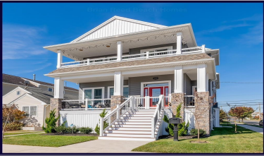
2400 WEST AVENUE Ocean City, NJ