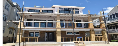
1116 OCEAN AVENUE