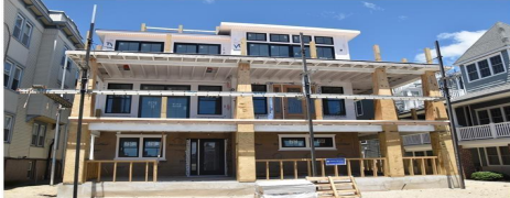
1116 OCEAN AVENUE