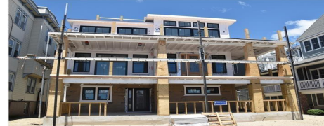
1116 OCEAN AVENUE