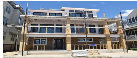
1116 OCEAN AVENUE