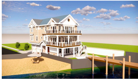
william mclees architecture