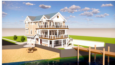
william mclees architecture