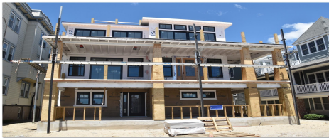
1116 OCEAN AVENUE