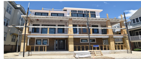
1116 OCEAN AVENUE