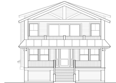
WEST AVENUE ELEVATION