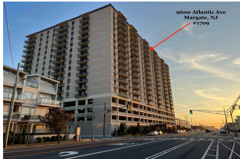
9600 Atlantic Ave Margate, NJ #1709