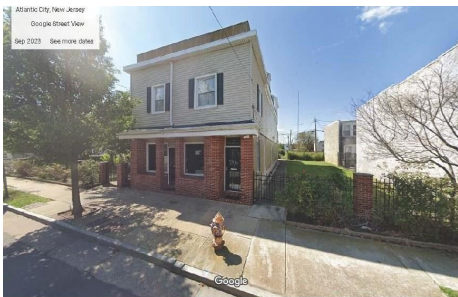
SJSRMLS Image created: Sep 13/20