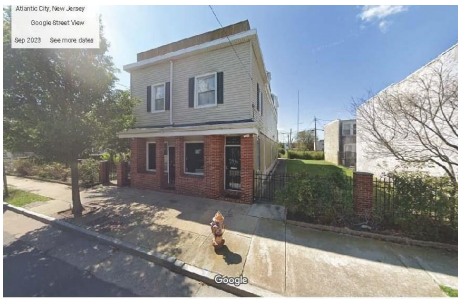
SJSRMLS Image history, Sep 13, 2023 © 2024 Google