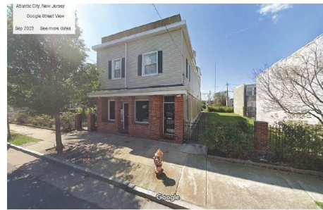
SJSRMLS Image created: Sep 13/20