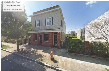
SJSRMLS Image history, Sep 13, 2023