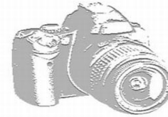
PHOTO NOT AVAILABLE