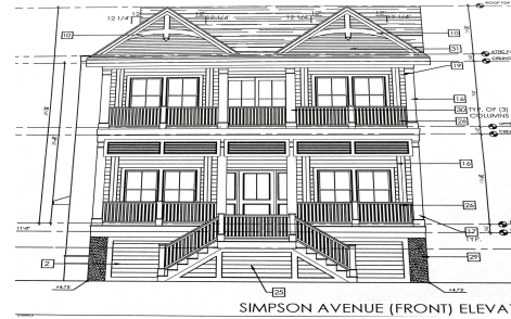
SIMPSON AVENUE (FRONT) ELEVATION