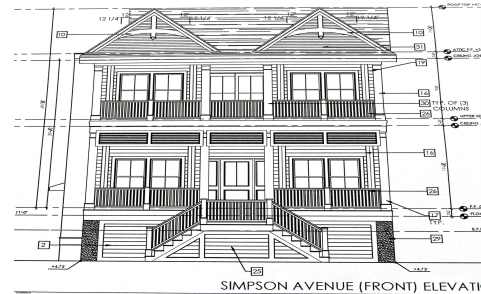
SIMPSON AVENUE (FRONT) ELEVATION