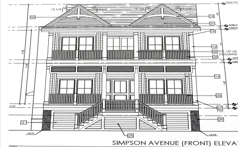
SIMPSON AVENUE (FRONT) ELEVATION