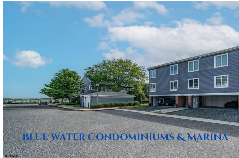
BLUE WATER CONDOMINIUMS & MARINA