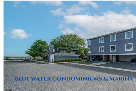
BLUE WATER CONDOMINIUMS & MARINA