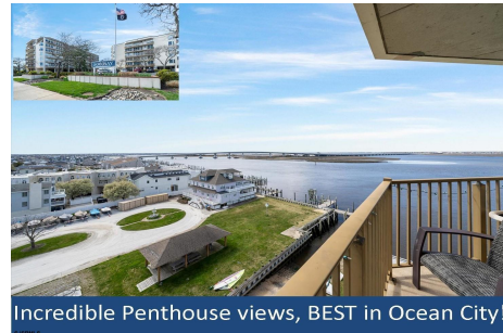
Incredible Penthouse views, BEST in Ocean City!