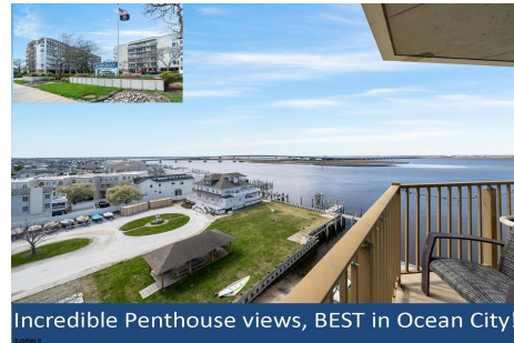
Incredible Penthouse views, BEST in Ocean City!