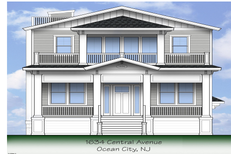
1634 Central Avenue Ocean City, NJ