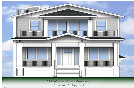
1634 Central Avenue Ocean City, NJ