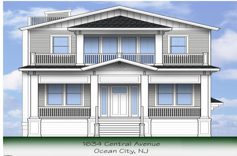
1634 Central Avenue Ocean City, NJ