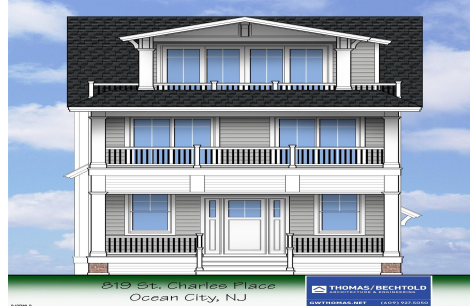
819 St. Charles Place Ocean City, NJ