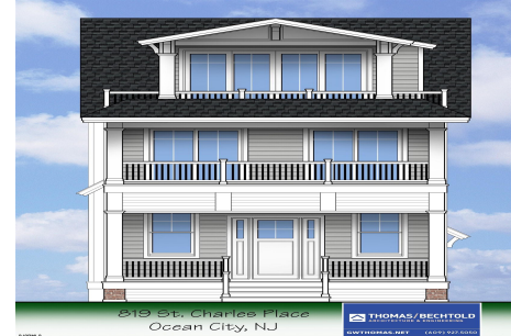
819 St. Charles Place Ocean City, NJ