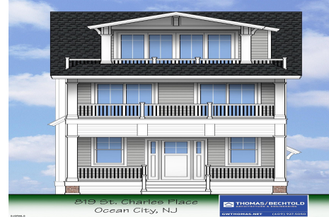
819 St. Charles Place Ocean City, NJ