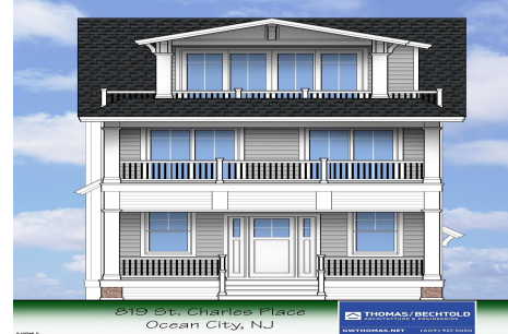
819 St. Charles Place Ocean City, NJ