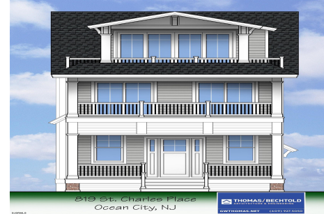
819 St. Charles Place Ocean City, NJ