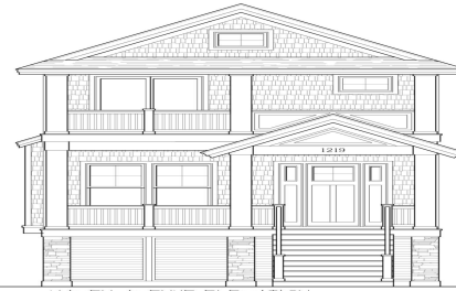
HAVEN AVENUE ELEVATION