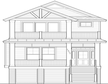
HAVEN AVE. ELEVATION