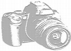
PHOTO NOT AVAILABLE