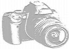
PHOTO NOT AVAILABLE