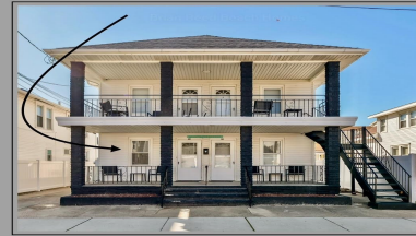
238 E Leaming Avenue Unit 1 Wildwood, NJ