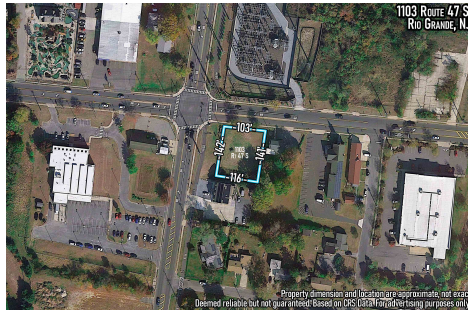
1103 Route 47 S, Rio Grande, NJ