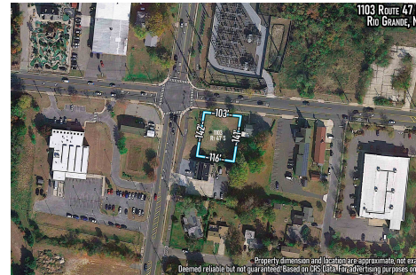
1103 Route 47 S, Rio Grande, NJ