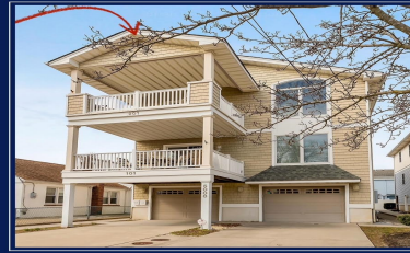
4 BEDROOM 2 BATH TOP FLOOR 5008 Arctic Avenue Wildwood, NJ