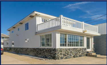
123 & Lincoln Avenue Wildwood, NJ 3 Bedroom 2 Bath Single Family