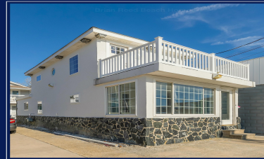
123 & Lincoln Avenue Wildwood, NJ 3 Bedroom 2 Bath Single Family