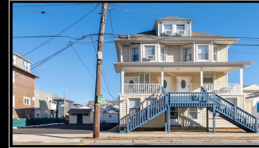
107 e Magnolia Wildwood, NJ 2 Bedroom Condo