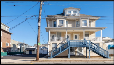
107 e Magnolia Wildwood, NJ 2 Bedroom Condo