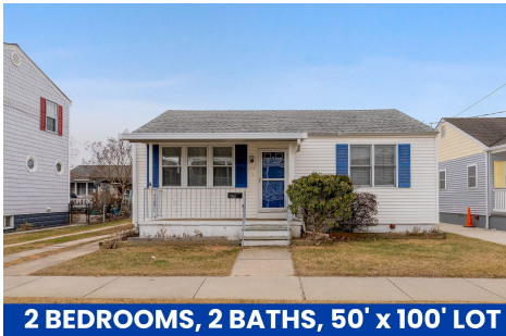
2 BEDROOMS, 2 BATHS, 50' x 100' LOT