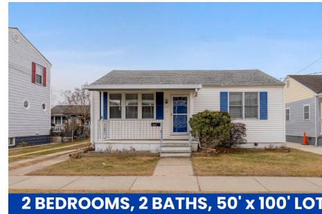
2 BEDROOMS, 2 BATHS, 50' x 100' LOT