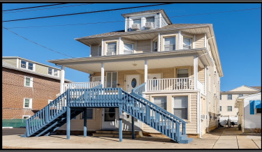
107 E Magnolia Avenue Wildwood, NJ 1st Floor 1 Bedroom Condo