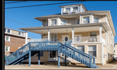
107 E Magnolia Wildwood NJ 6 Bedroom Townhouse