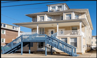
107 E Magnolia Wildwood NJ 6 Bedroom Townhouse