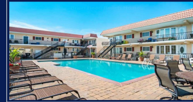
208 E 25TH AVENUE #201 NORTH WILDWOOD The Heritage Condominiums