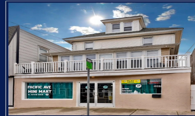
4 BEDROOM TOWNHOUSE AND STOREFRONT 3007 Pacific Avenue Wildwood, NJ