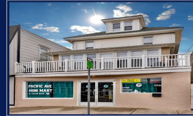
4 BEDROOM TOWNHOUSE AND STOREFRONT 3007 Pacific Avenue Wildwood, NJ