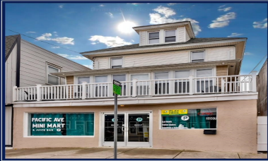
4 BEDROOM TOWNHOUSE AND STOREFRONT 3007 Pacific Avenue Wildwood, NJ