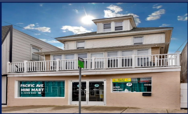
4 BEDROOM TOWNHOUSE AND STOREFRONT 3007 Pacific Avenue Wildwood, NJ