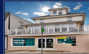
4 BEDROOM TOWNHOUSE AND STOREFRONT 3007 Pacific Avenue Wildwood, NJ