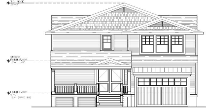
1 FRONT ELEVATION A4.1